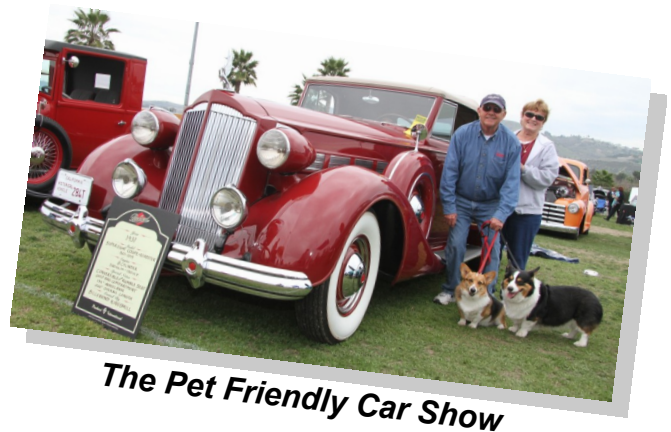
The Pet Friendly Car Show

What Gather on a Saturday morning (the day before Super Bowl Sunday) to share your passion for any of the things noted above. Food and drink readily available—breakfast, lunch, and refreshments for every taste.